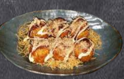
Takoyaki9Japanese style deep-friedbattered octopus w/mayo