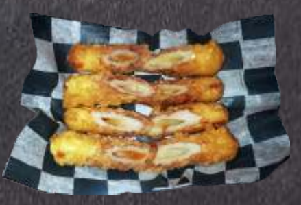
Isobe 10 Deep-fried fish cakes w/ house made mayo sauce