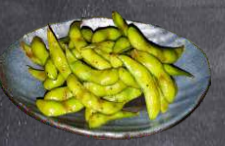
Edamame Plain 5 / Soy garlic 6 Sauteed edamame with sea salt or soy galic sauce