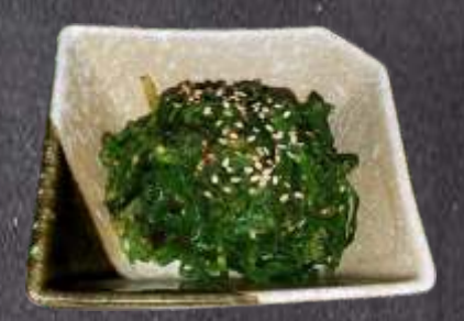
Seaweed Salad 6 Japanese seaweed salad