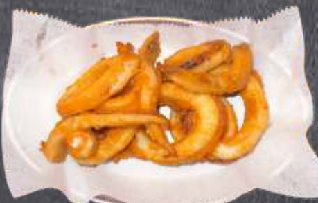
Calamari 11 Deep fried squid with mayo sauce